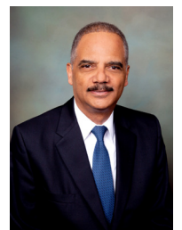
ERIC HOLDER Former U.S. Attorney General

Conference Registration Urban Schools Resource Room/Internet Cafe General Session C: Breakfast and Speaker: DONNA BRAZILE CONCURRENT SESSIONS ON BEST PRACTICES General Session D: Lunch and Speaker: ERIC HOLDER General Session E: Town Hall Meeting Urban Education and the Presidential Campaign Moderated by: DAN RATHER Great City Colleges of Education General Meeting Reception at the Biscayne Lady Yacht