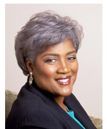
DONNA BRAZILE Political Commentator

Conference Registration Urban Schools Resource Room/Internet Cafe General Session A: Breakfast and Address from Chair of the Board CONCURRENT SESSIONS ON BEST PRACTICES General Session B: Lunch and Speaker: TBD CONCURRENT SESSIONS ON BEST PRACTICES Executive Committee Meeting Cocktail Reception 27th Annual Green-Garner Banquet ( Semi Formal Evening Attire ) Hospitality Suite- Karaoke Night