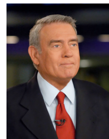
DAN RATHER Broadcast Journalist